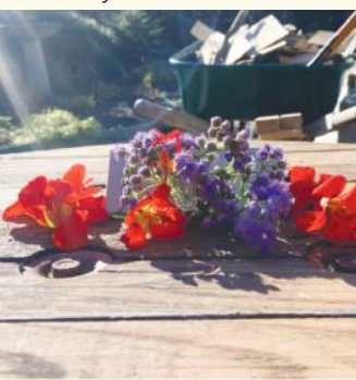
October work weekend flowers

Dutch mystic of the Holocaust (1914-1943), in 1943 Etty and her family were placed on a transport train to Poland. From the train window she tossed out a card that read, "We have left the camp singing."