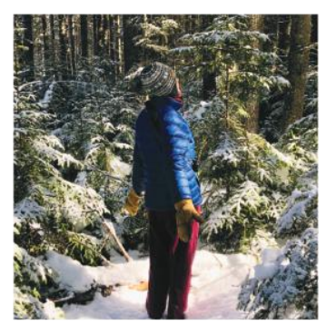
Moss kingdom under the spruce

Cinnamon-tufted elegance swam in the gloaming, 30 of them in identical coppercolored vee's out the neck of the cove into golden haze at the western edge of light. Low mewing to each other in their exodus, otherwise silence, even fromthe Kingfisherwhowatched them go, a Merganser Moment.